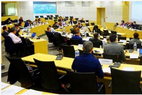
Pictured above: This month's meeting of the Council for Penological Co-Operation (PC-CP) in session, in Strasbourg.